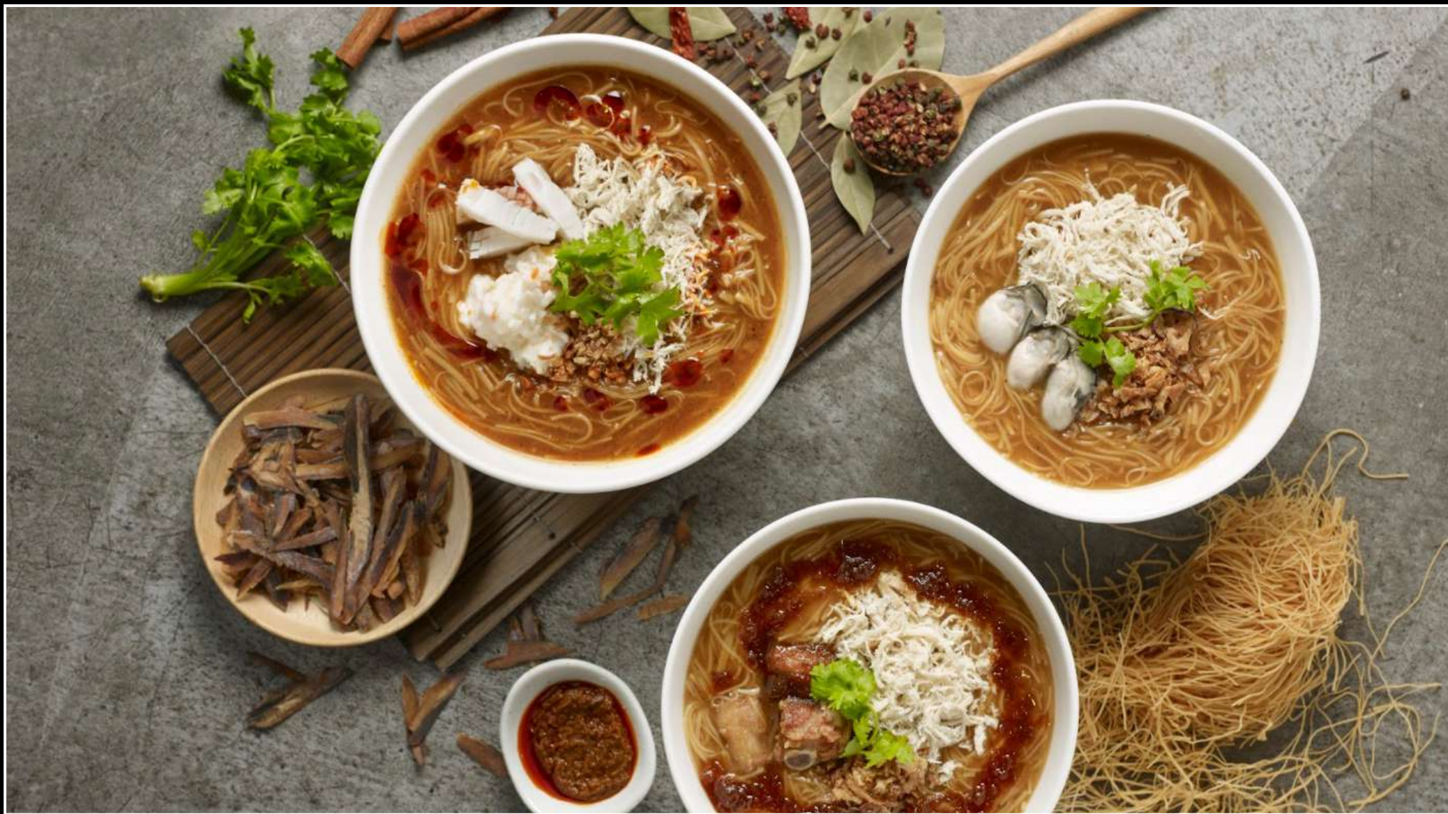
SIGNATURE MEE SUA